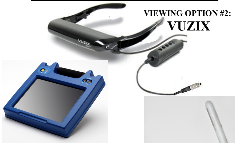
VIEWING OPTION #2: VUZIX