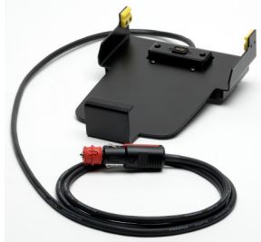
STAND ALONE CHARGER