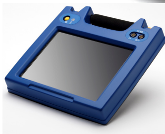
VIEWING OPTION #3: WIRELESS MONITOR